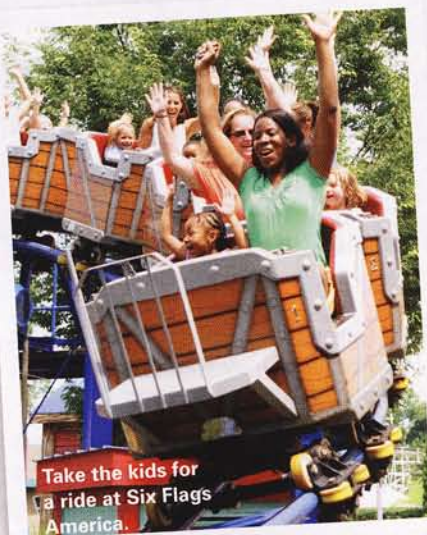
Take the kids for a ride at Six Flags America.